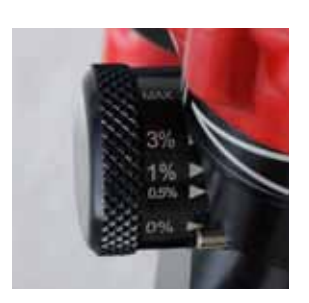
Multiple Proportioning Settings (75 liter model shown)